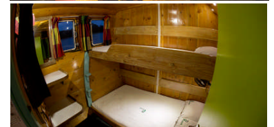
Layout of M.L. Bawali