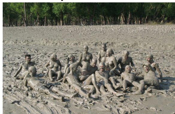
Mud Bath in Sundarbans

For confirmation and Payment, Please Contact the Conference Secretariat